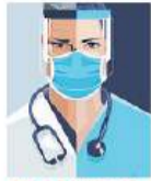
FROM THE FRONTLINE PART-IV

Since 1896, Bubonic plague spreads like wildfire in Mumbai (formerly Bombay) leading to about 1,900 deaths a week for the remainder of the year. The Epidemic Diseases Act (EDA) is enacted in 1897 to empower the government to tackle the crisis.