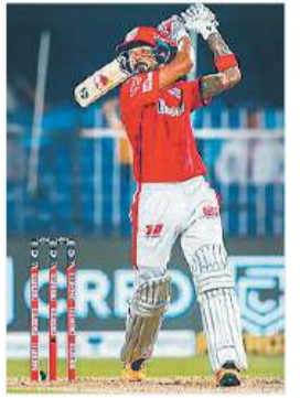
Mushtaq Ali T20 champion.

The BCCI plans to get the domestic season underway, after several months' delay, in January with the Syd