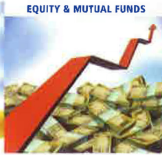
EQUITY & MUTUAL FUNDS