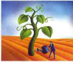
SAVINGS & FIXED DEPOSITS