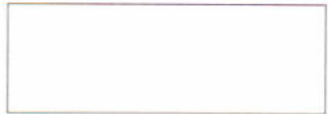
Signature of Mandate Holder