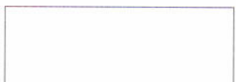
Signature of Third Applicant