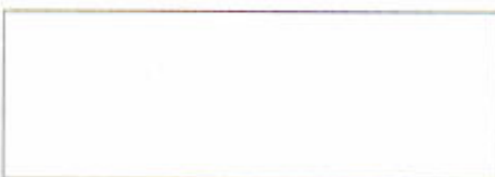
Signature of First Applicant