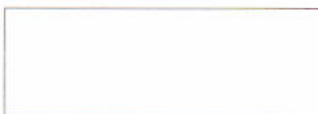
Signature of Second Applicant